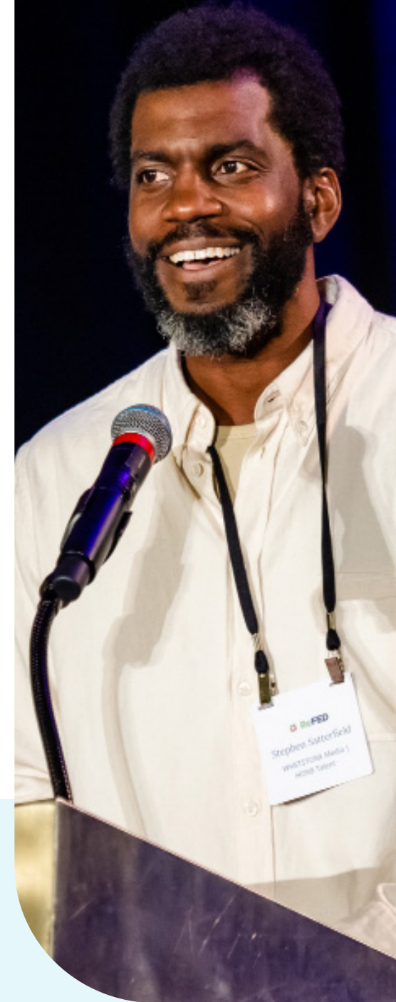
Stephen Satterfield, Food Writer, Media Entrepreneur, and TV Host.

1-10 Attendees 10-30 Attendees 30+ Attendees