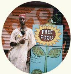
Produce Transported to Foodbanks