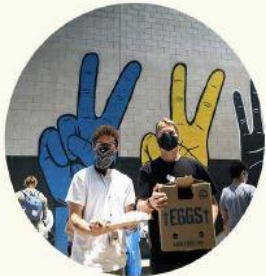
Students Source Unsold Produce