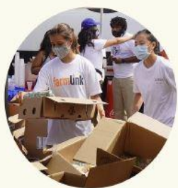
The Farmlink Project Receives Donations